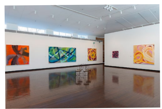
Source: Ildiko Kovacs, The DNA of Colour, installation view, Drill Hall Gallery, 2019. Photo: Rob Little.